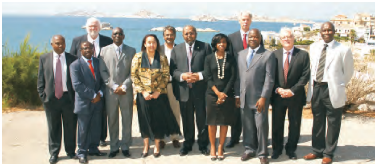
Members of the ACBF Executive Board at a meeting in Marseille, France