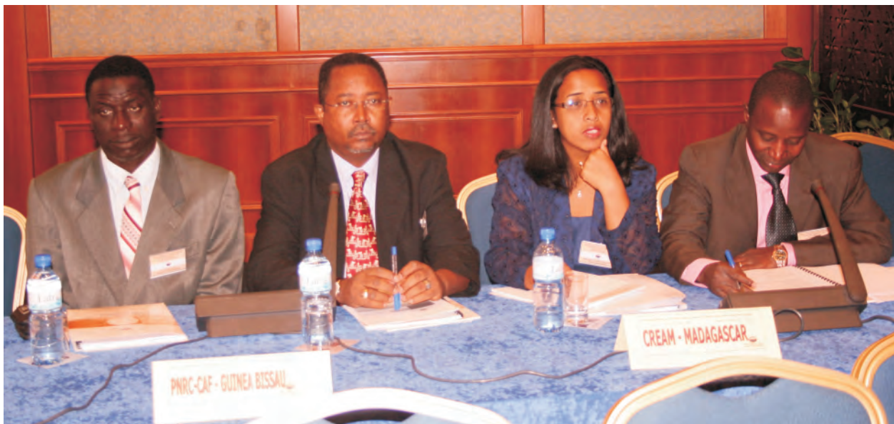
ACBF Projects/Program representatives attending the No Objection Procedures Workshop held in Ouagadougou, Burkina Faso in December 2008.

The Government of Italy gave a very good response to the work of ACBF. However, as a result of the global financial crisis, they would have problems in providing core contributions to any organizations over the next few years. The above notwithstanding, the Government expressed its readiness to consider a contribution to the Foundation, which could be identified with specific activities either of a generic nature (e.g. knowledge management and networking) or in respect of individual projects in countries that Italy has an interest in (US$5-10 million).