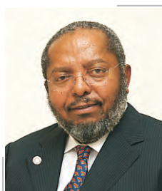
Emmanuel Tumusiime-Mutebile Chairman