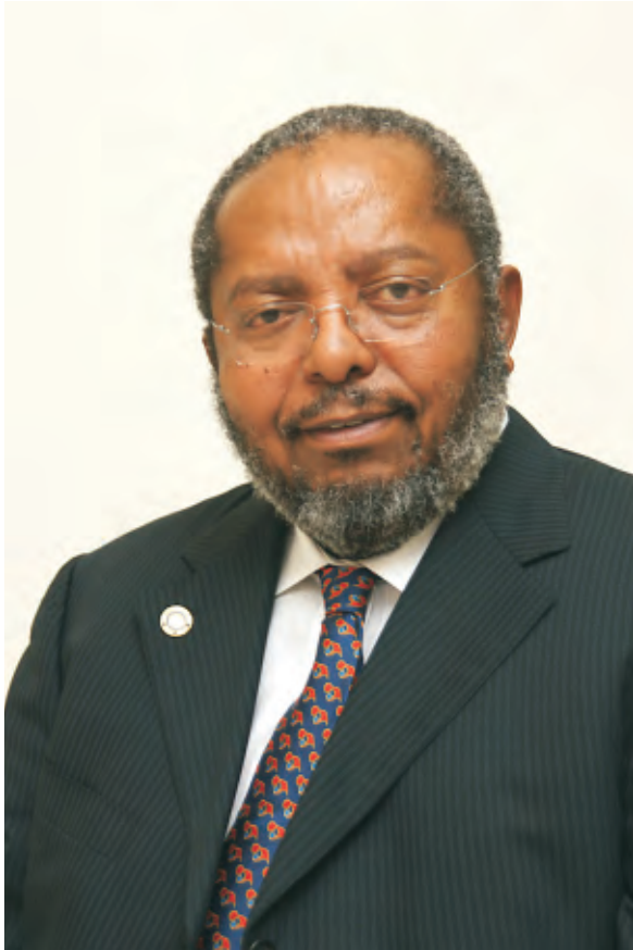
Emmanuel Tumusiime-Mutebile Chairman, Executive Board