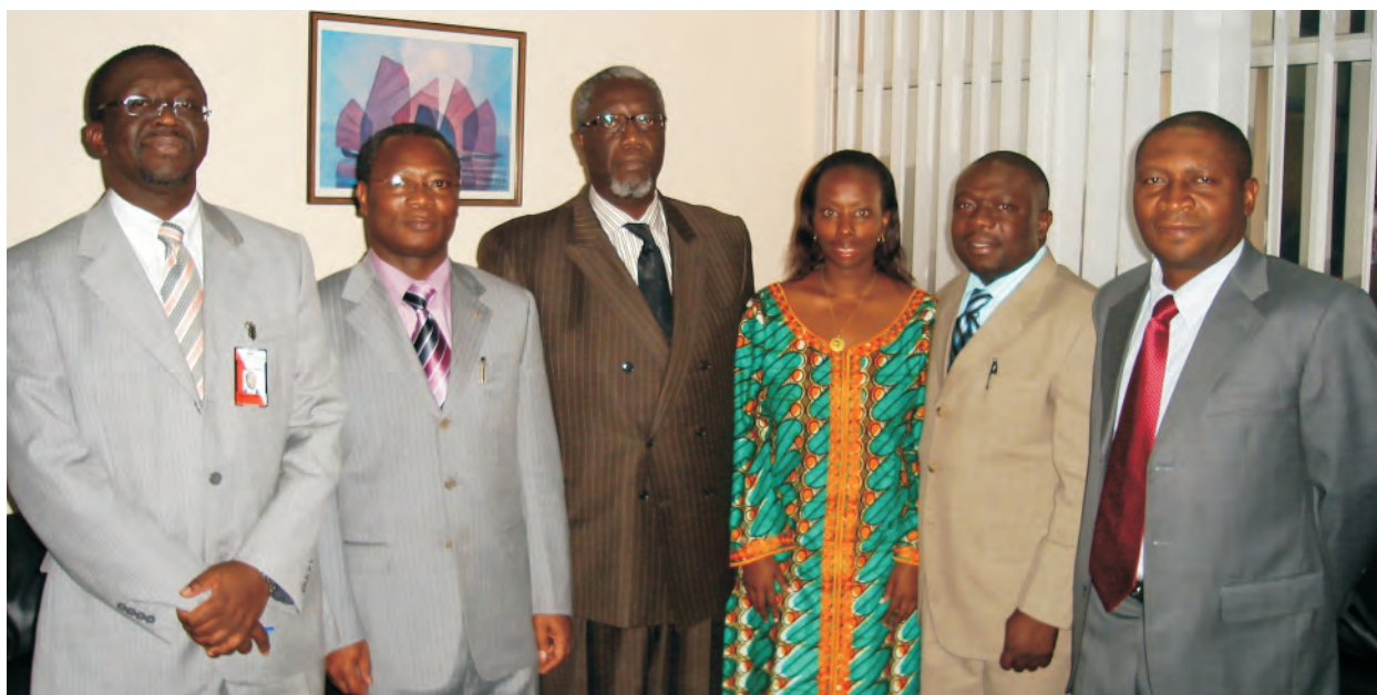
The ACBF-UNECA negotiating teams in Addis Ababa, Ethiopia

To facilitate the implementation of this Memorandum of Understanding, both parties intend to jointly develop work plans on an annual basis.